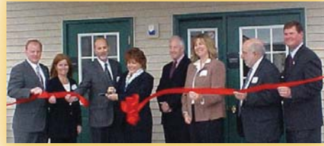
Meadowside II ribbon-cutting ceremony

In 2005 SCAP, Inc. proudly celebrated the completion of Meadowside II , a 40-unit, multi-family real estate property in Penn Yan. The opening of Meadowside II represents the 120 th unit SCAP co-manages in Penn Yan in partnership with Conifer Realty, LLC.