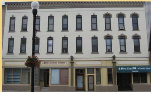
Seneca Street Station apartments are renovated.

SCAP, Inc. continues to manage its properties with the utmost attention to tenant safety and structural maintenance, ensuring community access to safe, secure dwellings at a rent that is affordable against the backdrop of local wages.